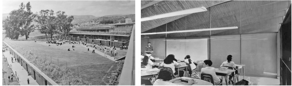
Figure2. Liceo Franco-Mexicano, View of the classroom and the roof – gardens which double as playground / interior classroom, Mexico, Alberto Kalach

This book also introduces about contemporary architecture and Modernist Masters in Latin America that manifests efforts and research experiments in Architectural methodology. All contents in the book provide the progress architectural works in Latin America in all dimensions. The consequence chapters describe the tradition, creativity, innovation, and problem solving that reveal the uniqueness of Modernist Masters and beyond. The architectural merit of the projects lies in the imaginative interpretation of economic, technological, physical, and cultural factors that architects carry out in order to pursue typological experimentation. Although, most of the architectural case studies excludes some countries in Central America like El Salvador, Nicaragua or Honduras, the book demonstrates the innovative solutions, produced by architects in different countries throughout Latin America. They can seemingly be substituted for architects of all Latin America. Most of the projects represent the potential of contemporary and new generation architects in Latin America. They fulfill formal explorations with great environmental concerns. Finally, the book explains the reason why architects from Latin America countries have won all major architectural awards in the world and received more international recognition in the past 10 years.