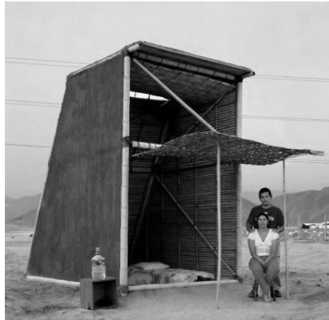
Figure 1. View of Teatina-Quincha Shelter, Peru, Alexia Leon

the building surface. Apparently, the creativity issue is inexpensive cost, ready to build, and local people are familiar with construction process.