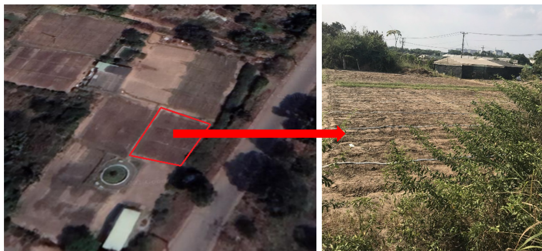
Fig. 1. The research field of the Faculty of Agronomy, Nong Lam University HCMC, Vietnam.

in pH with low organic matter, total K, and total N, but sufficient in available potassium and phosphorus. Therefore, it is necessary to add more nutrients during the trial planting of maize. The summary can be found in Table 1. The research area has a tropical monsoon and sub-equatorial climate, with year-round high temperatures and two distinct rainy and dry seasons, which have a significant impact on the landscape environment.