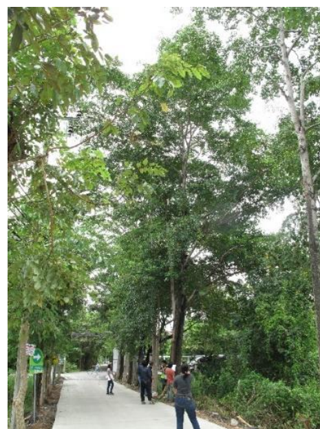
Figure 5. MX: Terminalia calamansanay Rolfe.