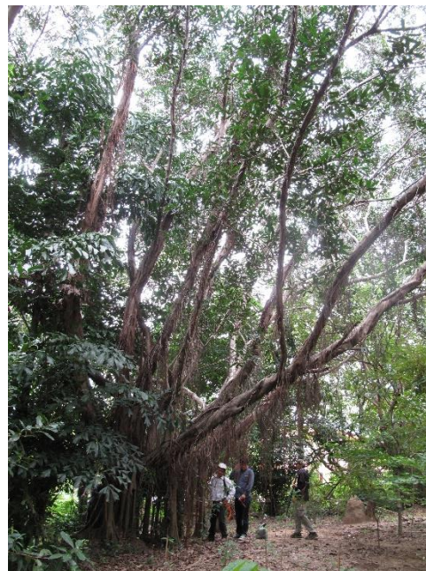
Figure 3. DY: Ficus curtipes Corner.