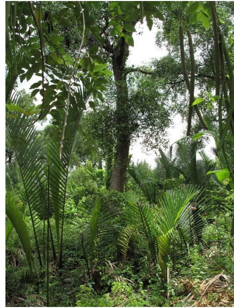
Figure 7. MG: Sonneratia caseolaris Engl.