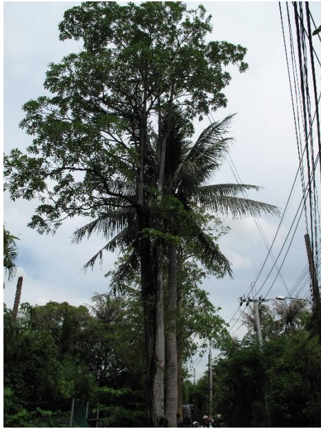
Figure 6. MG: Cerbera odollam Gaertn.