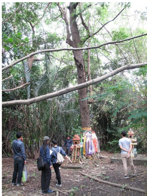
Figure 2. DY: Hopea odorata Roxb.

London (Great Britain), Los Angeles (United States), Mexico City (Mexico), Moscow (Russia), Mumbai (India) and Tokyo (Japan) can be estimated as 482 million USD/year due to reductions in CO 2 , NO 2 , SO 2 , PM 10 , and PM 2.5 and 8 million USD/year due to CO 2 sequestration. As the result, Bang Kachao Green Space has been an important part of fresh air quality, not only improving the urban areas but also improving the quality of life too.