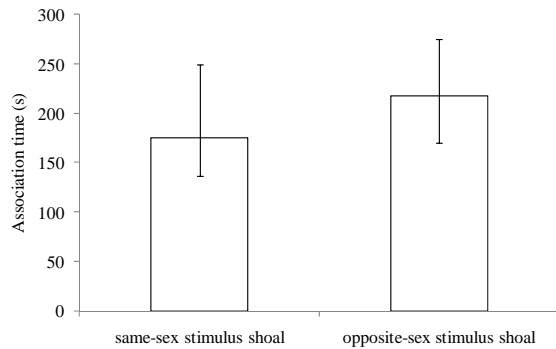
Figure 2. The histogram shows association time (medians \pm quartiles) displayed by male focal fish.

observer sat motionless 2 metres in front of the test tank and the pulley over the test tank was raised to release the focal male fish from the release tube. As soon as the focal male fish entered the stimulus zone for the first time, the trial was commenced. Each trial lasted for 10 minutes (600 seconds), with the observer measuring how long the test fish spent in the shoaling zone next to a same-sex stimulus shoal VS an opposite-sex stimulus shoal by using two stop watches to measure time spent in each shoaling zone. The test fish was considered to have either entered or left the zone as soon as its snout either entered or left the shoaling zone.