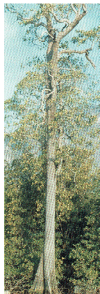
Figure 5. A tall Bruguiera gymnorhiza : coastal protection plus!