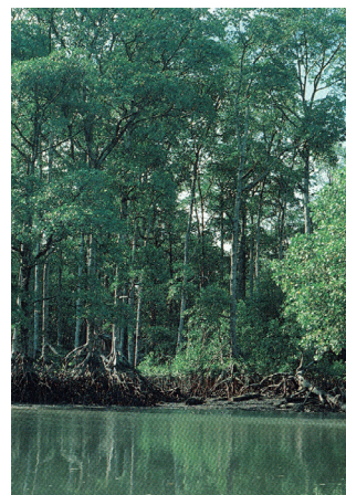
Figure 4. Rhizophora forest: resources for coastal protection.

Barbier (2011) created a rather negative criticism of the idea that mangroves could act as natural barriers against extreme events, such as the Asian tsunami (2004), when he contended that the evidence in support of this protective function was 'at best mixed' (P.113). It is true that tsunami's can deliver huge waves, but some Japanese research presents a very favorable assessment of attenuation of tsunami energy by mangrove forests. Hiraishi and Harada (2003) claimed that this attenuation could be as good as a 90% reduction in maximum tsunami flow pressure for a 100m wide forest with a tree density of 3,000 stems per ha. Mazda et al. (1997) found that while seedlings of K. candel were ineffective in dissipating wave action, larger specimens of this mangrove tree were; K. candel trees reduced wave action by 20% over a 100m distance. Clearly, this topic invites more research and such research may help to reduce the apparent variability in results. Not all mangroves have the same morphology and this fact alone can invite bioengineering and biophysics approaches to determine which tree shape or architecture is best at sea wave energy dissipation and which species invests more biomass into its above ground root biomass (AGRB).