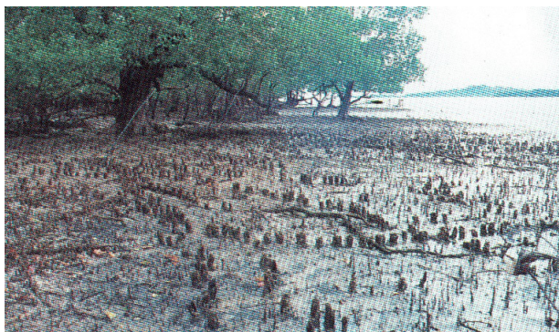
Figure 6. Sonneratia 's extensive root biomass: coastal protection and land building (sediment stabilization).

Just as there is neglect in this area of mangrove valuation, there remains on-going debate about another outstandingly important question, that of mangroves and fisheries. We will now consider fisheries and conclude with an exciting future prospect, that of the biomedical roles of mangrove extracts and the iconic attraction of tigers and dolphins as enticing topics for mangrove valuation in the future.