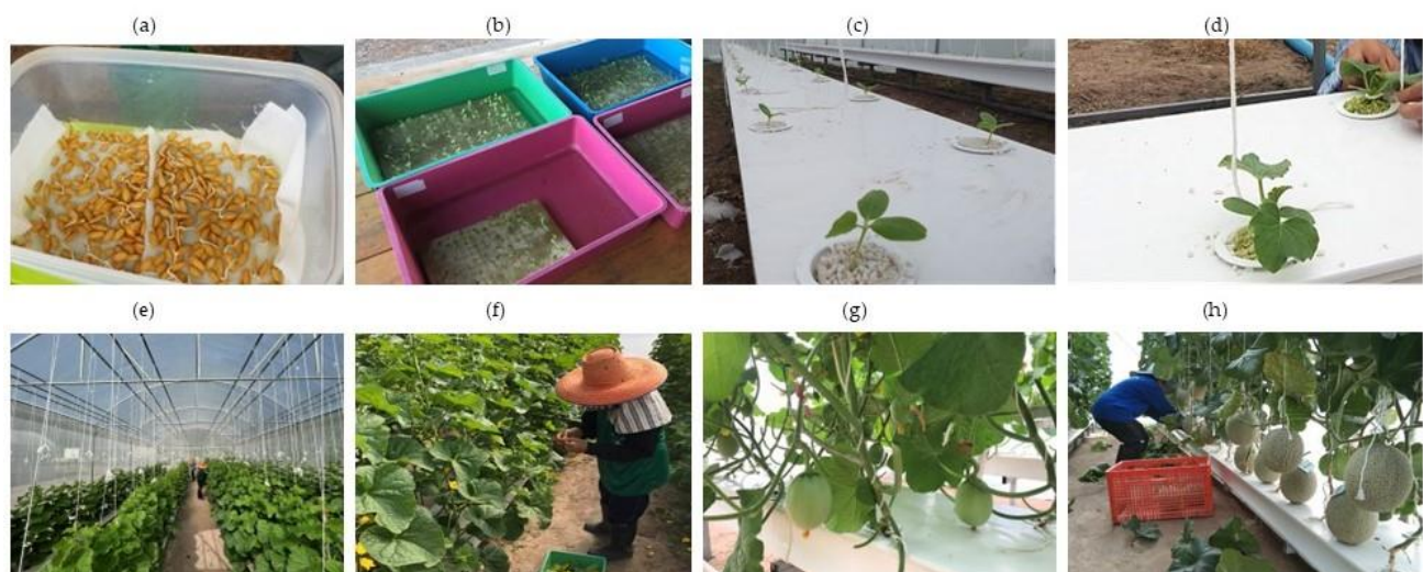
Figure 2. Melon cultivation: (a) seed germination, (b) seedling nursery, (c) transferring seedlings to planting channels, (d) wrapping twine around the plant for support, (e) caring for plants and pruning side branches, (f) pollination, (g) fruit selection and (h) harvesting the produce